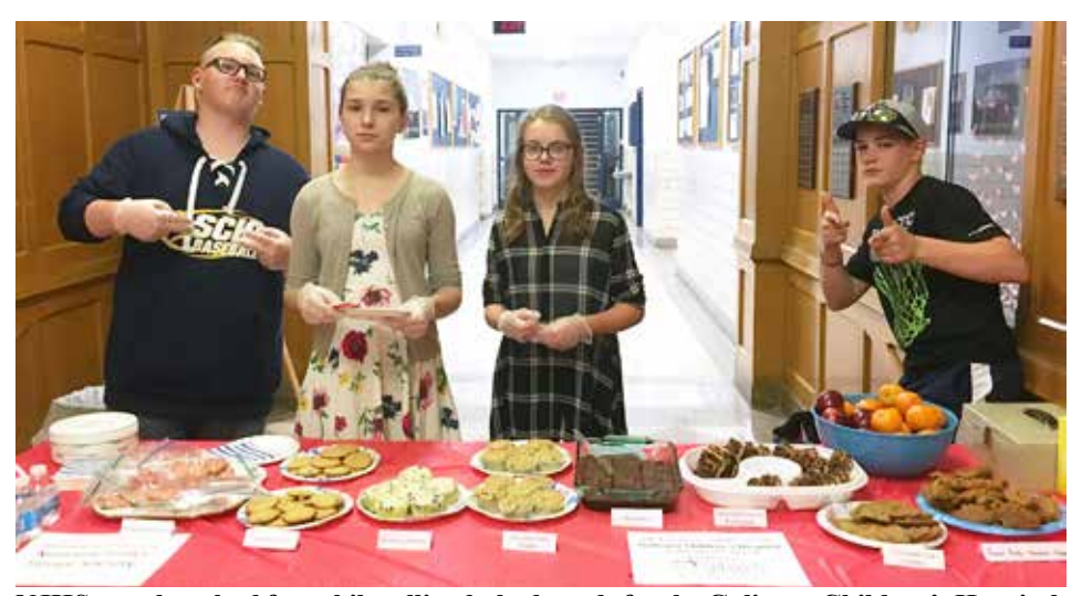
NJHS members had fun while selling baked goods for the Golisano Children's Hospital.

Each existing and incoming NJHS member has a need to make our school and community a better place, reaching a hand