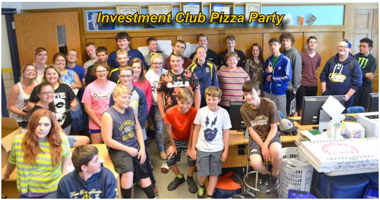
FBLA Investment Club participants enjoyed a pizza party.